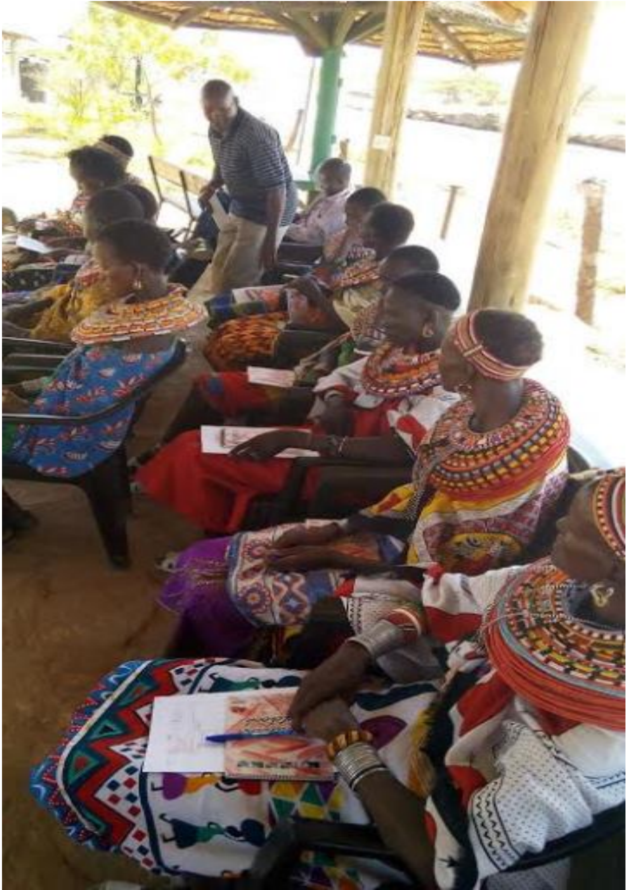
Figure 2: A planning meeting of Losesia group ranch